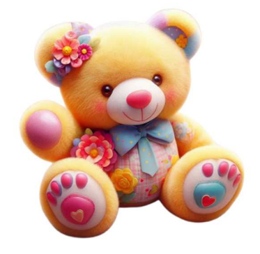
My teddy bear