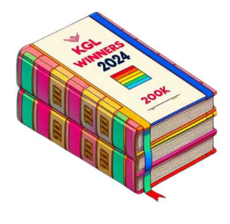
My KGL books