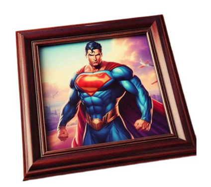
My superman picture